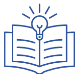
COLLEGE & CAREER READINESS

United Way Youth Programs and Initiatives are working to promote College & Career Readiness, Health & Wellness, Economic Stability, and Community Connection.