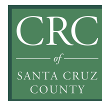
CONFLICT RESOLUTION CENTER